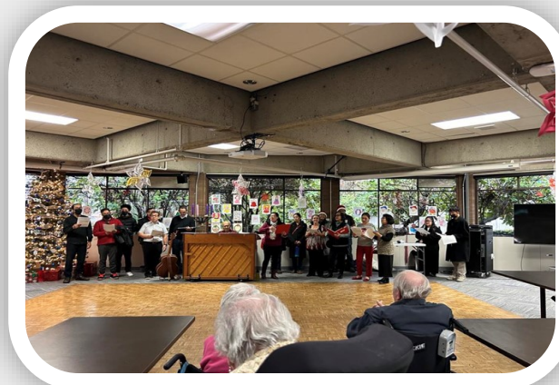
Picture of some of our 9 am, 11 am and 7 pm choir members spreading some Christmas joy during their caroling session for the residents of the Chénchenstway Care Home.